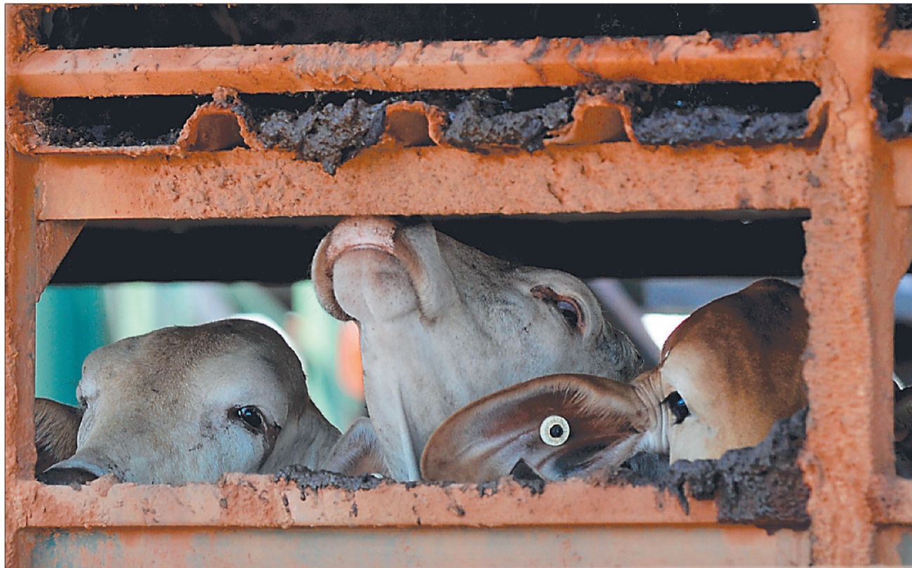
Reports of animal abuse pour out of Indonesia, Turkey and the Middle East

A USTRALIA'S Government refuses to listen to its people. Every day countless Australians ask the Government to end the cruel and inhumane live animal export trade. But Parliament doesn't care enough to respond and, as a result, the global community thinks Aust-